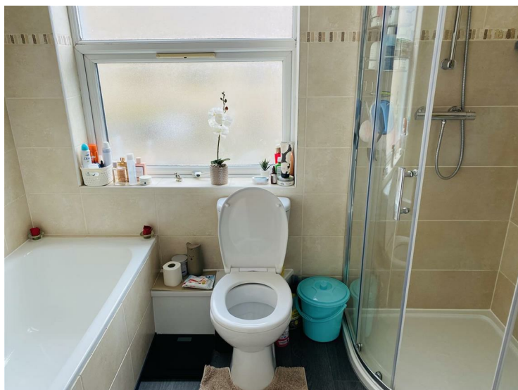
Modern suite comprising tiled enclosed bath with mixer tap, wash hand basin with mixer tap and vanity unit below, tiled enclosed shower cubicle with wall mounted shower unit, tiled walls, front aspect double glazed frosted window, heated towel rail.