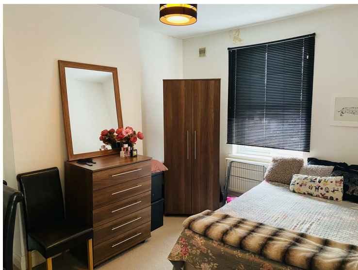
Rear aspect double glazed window, radiator.