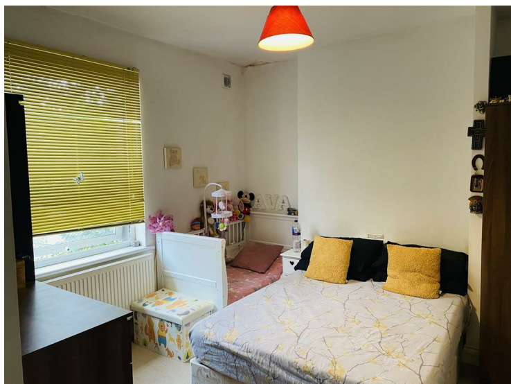
Front aspect double glazed window, radiator, power point.